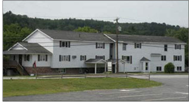
The Parent Child Center's current facilities are in a converted apartment building.

The current building is used for a myriad of purposes, all necessary to improve the lives of young families. In addition to providing program space, the building squeezes in office space for administrators and home visit staff with personnel stacked 5 to 6 per room. It also hosts a thrift store known as Myrtle's Closet, part of a job training program for teen parents. Thirteen outside doors create significant security hazards and the configuration of the building complicates and impedes staff communication.